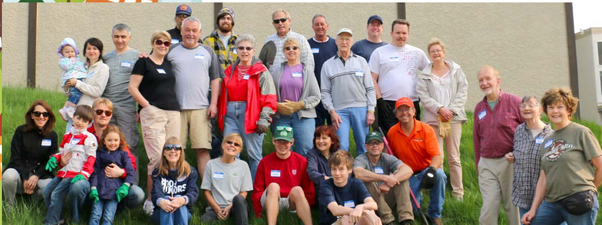
Spring 2016 Neighborhood Tree Grant Planting at Valhalla Park Condominiums NW