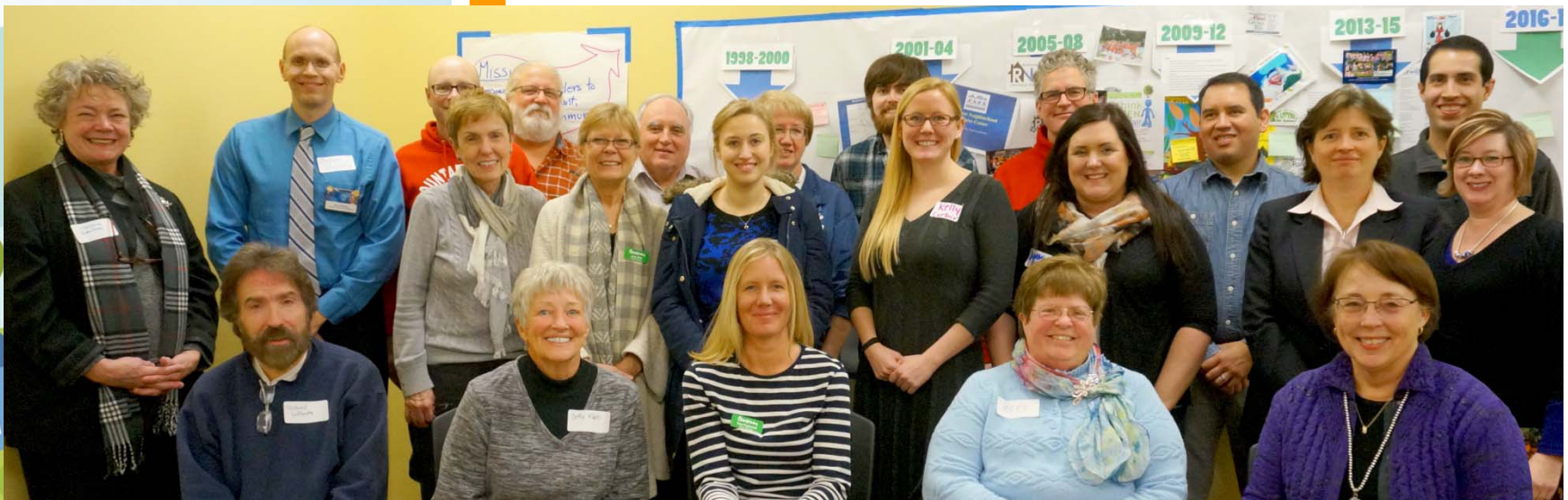
January 2016 RNeighborhoods Strategic Planning Session