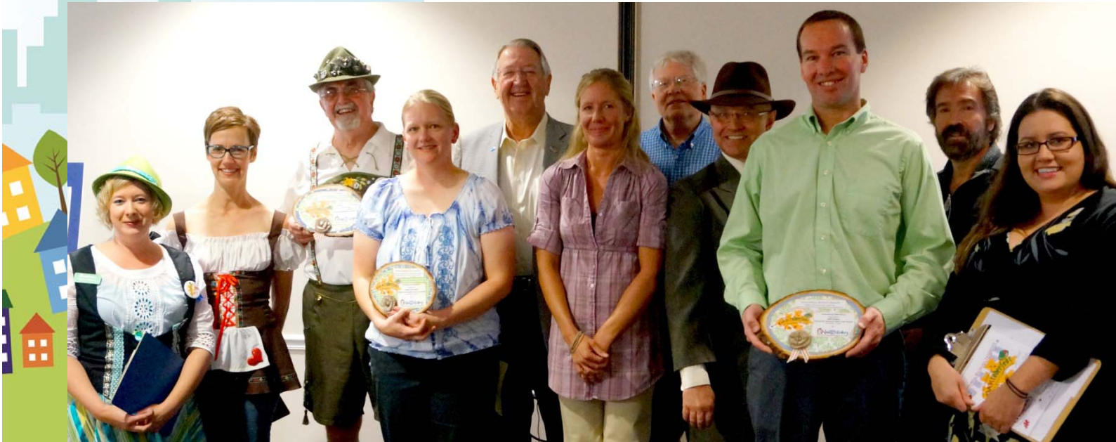
OAKtoberfest 2015 Neighbor Award Winners