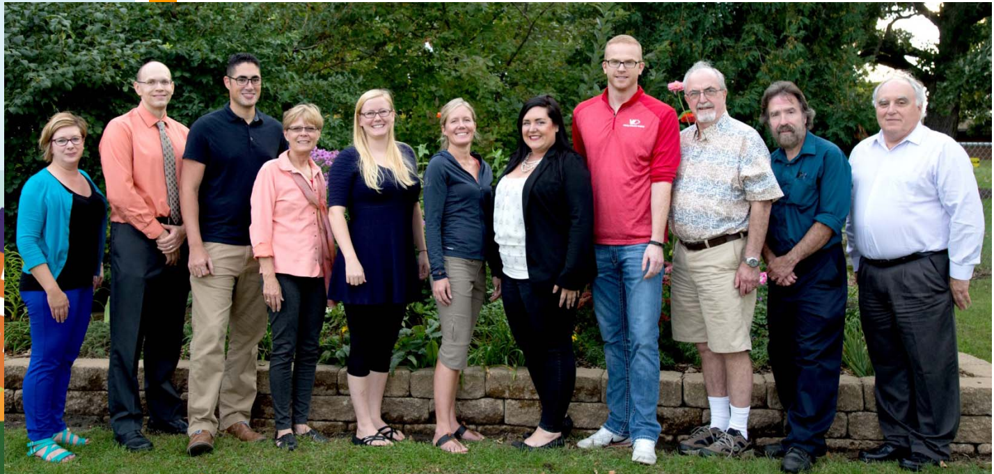
2016 RNeighbors Board of Directors and Staff

To empower citizen leaders to create sustainable neighborhood networks that promote a vibrant, healthy and livable community.